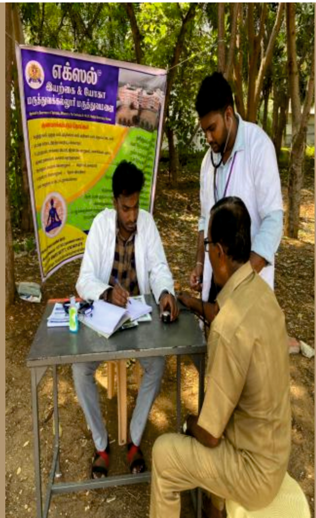
A free medical camp was organised at EGI medical campus ground on the RTO inspection. Few glimpses of the camp.