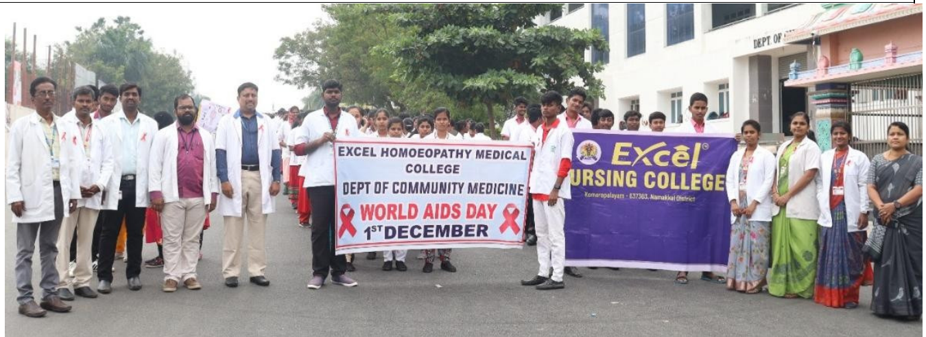
Excel Nursing College and Excel Medical College Homeopathy combined together and organized the World AIDS Day Awareness Rally on 01/12/2022.