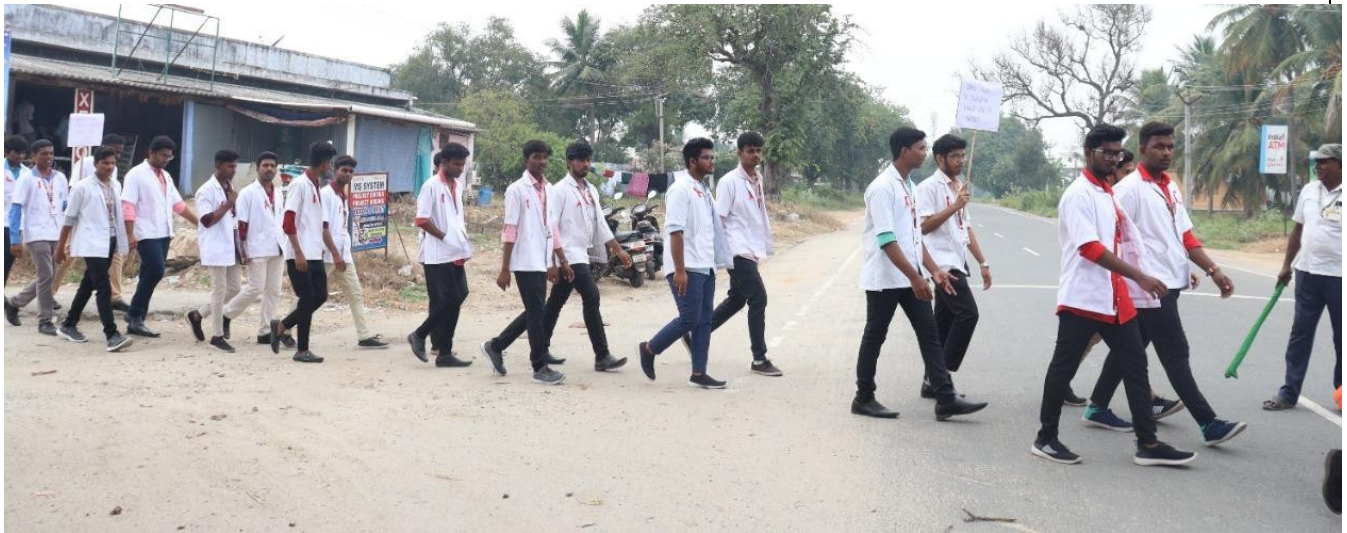
Around 400 students and faculty members participated. The students spread awareness about AIDS to the public through slogans and placards.

The volunteers of Nursing students, along with the Diploma Health Inspector students helped in the conduct of a Blood donation camp was in Excel Medical Block on 16/11/2022. The camp was organized by Tamilnadu Voluntary Blood Bank, Erode and Excel Group Institutions, Komarapalayam.