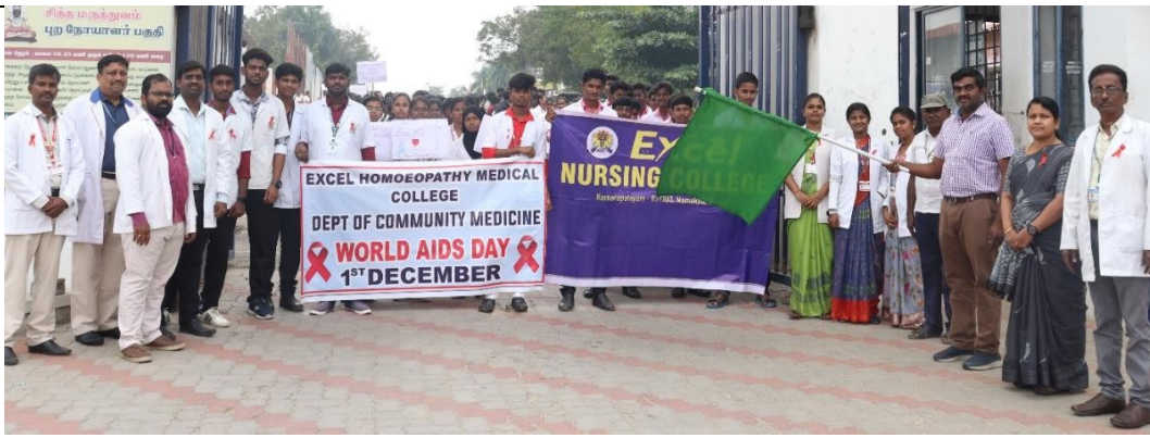
The Rally started from Excel College Campus to Muniyappan Kovil Primary Health Centre.