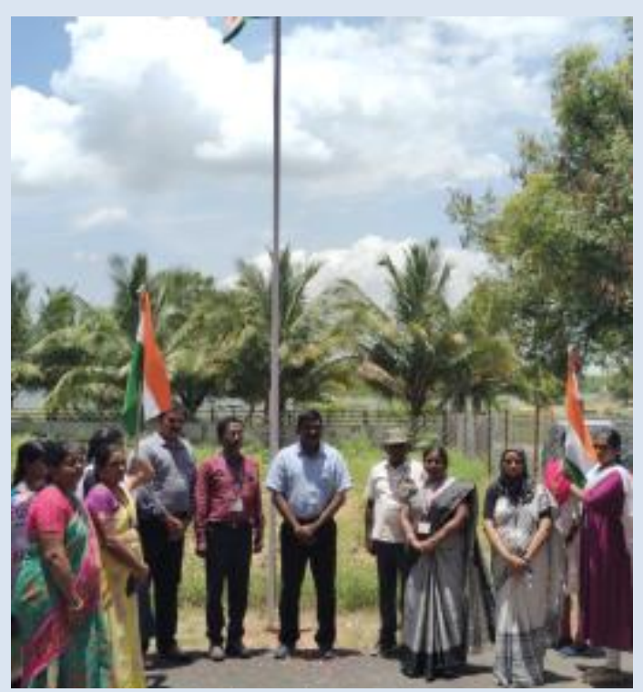
FLAG HOISTING AT COLLEGE CAMPUS "HAR GHAR TIRANGA"2022