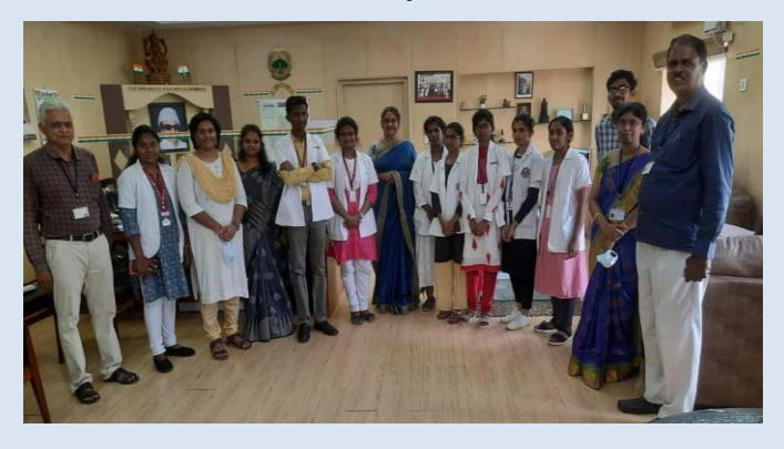
With the Vice-Chancellor

EMCNY's Participation in The Tamilnadu Dr. MGR Medical University's Celebrations