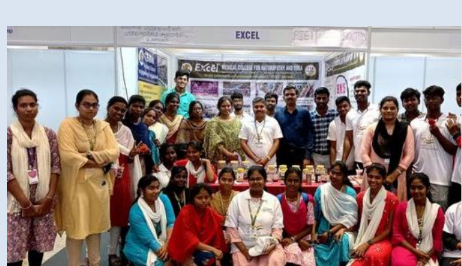
At the Naturopathic Food Court