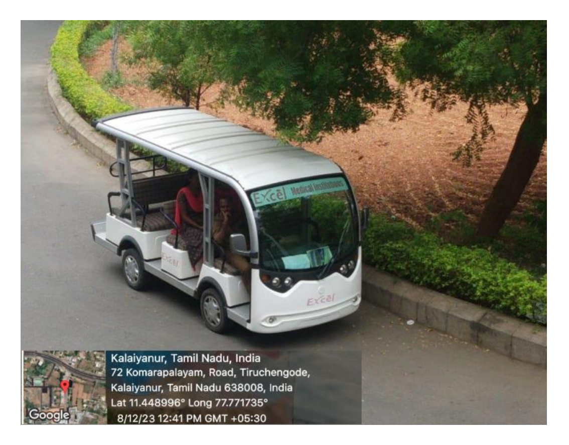
2. Use of bicycles/ Battery-powered vehicles