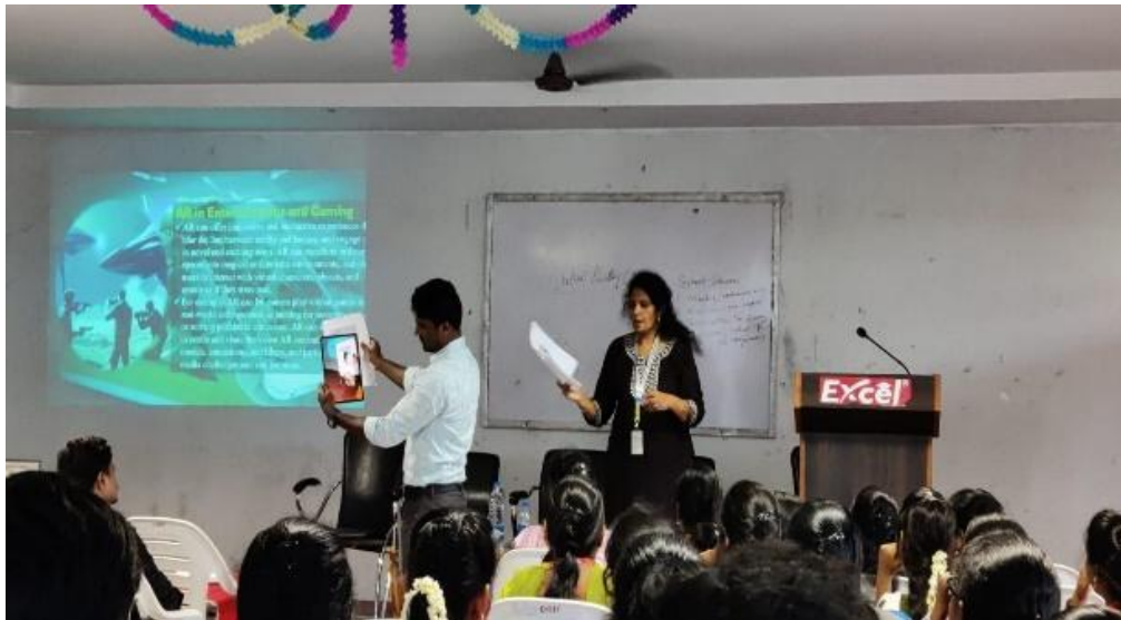
Project Presentation by MBA Core students