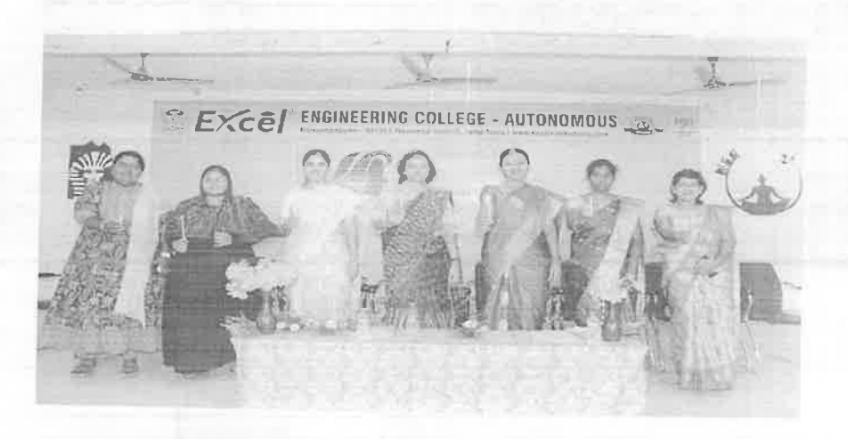
On Women's Day we realized "Seed Pen" to all the members