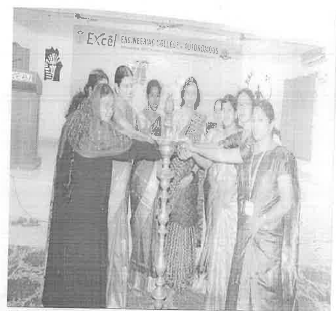
Inauguration on womens day Celebration on march 8,2023